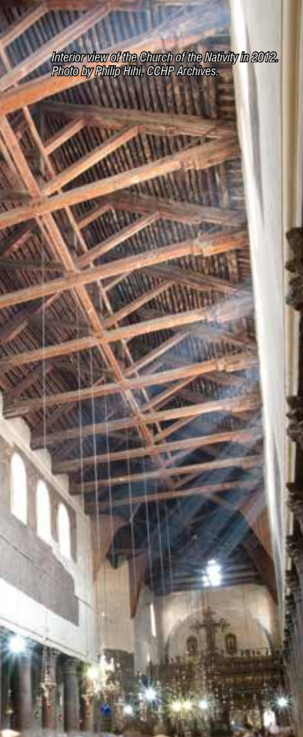
Interior view of the Church of the Nativity in 2012.