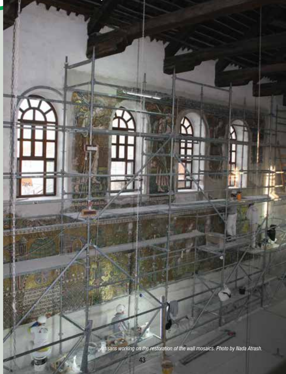
Artisans working on the restoration of the wall mosaics.

How was the Presidential Committee founded and what is its role in the restoration of the Church of the Nativity?