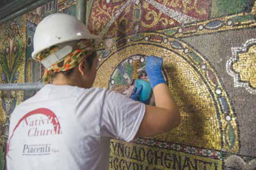
Restoration of the wall mosaics.

The Presidential Committee for the Restoration of the Church of the Nativity was founded in 2009 through a presidential decree by His Excellency President Mahmud Abbas in order to carry out a thorough restoration of the church according to modern, scientific principles of renovation. The committee has played a pivotal role in ensuring the approval of the Churches for this restoration endeavor and has coordinated with them the smooth implementation of all the work, aiming to assure that no disturbances are caused to the daily activities that take place inside the church and include prayers and visits of visitors and pilgrims. In addition to its responsibility for securing and managing the funds, the committee is responsible for the overall management of the project and follows up with the consultants and contractors on a daily basis.