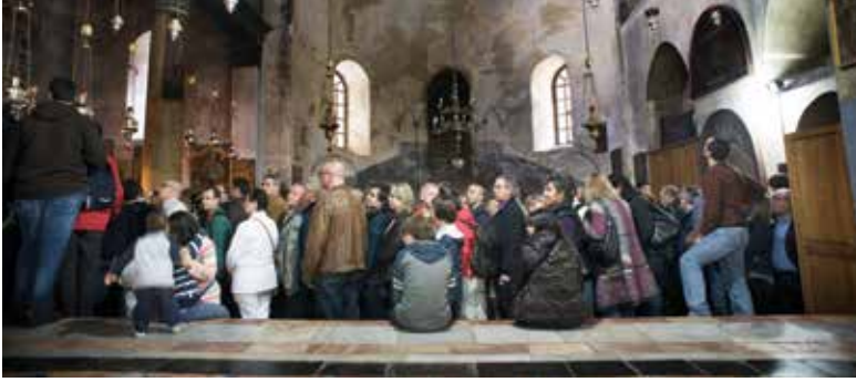
Pilgrims inside the church in 2012.

Bethlehem and the Church of the Nativity have been a destination for pilgrims, they are a focus of Christian belief and worship, and together with Jerusalem they are at the heart of the Christian world. The restoration in general, and especially that of features that are obvious to the eyes of visitors such as the wall mosaics and the icon paintings on the columns, are expected to attract visitors interested in art and cultural heritage, besides delighting the pilgrims. The work implemented to preserve and beautify the Church of Nativity, undertaken by the State of Palestine and showing its tireless efforts, send a clear message to the world that we Palestinians appreciate our cultural heritage, seek its protection, and extend our efforts to present it to the whole world in its best shape. We intend to emphatically communicate to the world that the birthplace of Jesus Christ and we as its inhabitants are seeking peace and justice - and we are showing this yearning through the restoration of the birthplace of the King of Peace.