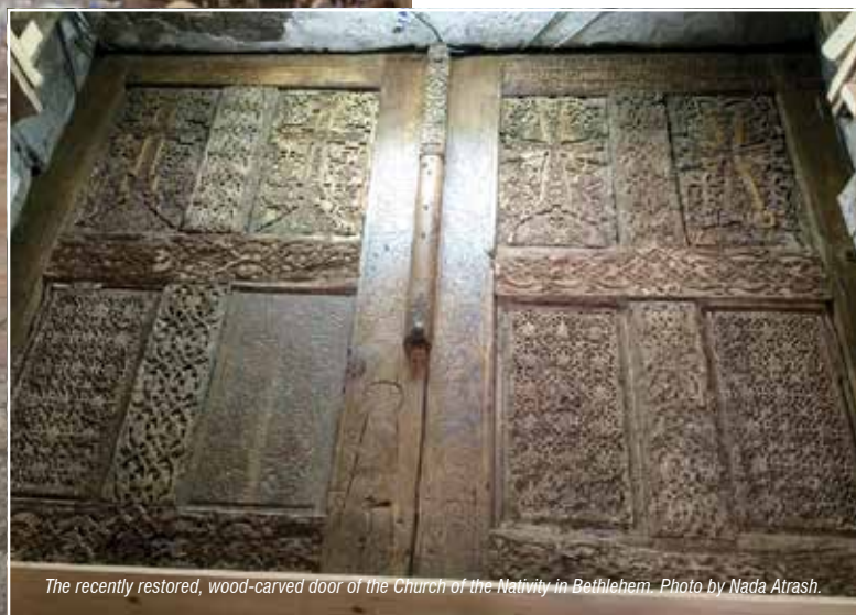
The recently restored, wood-carved door of the Church of the Nativity in Bethlehem.

The third phase has included the restoration of the parts of the external walls that require the use of a scaffold, restoration of the internal wall plaster, and the restoration of the mosaics that cover the upper walls of the aisle. The restoration of the wall mosaics has revealed that parts of the mosaic had been hidden under the plaster. While all of the restoration tasks are important, most notable to the visitors of the church is the wall mosaic, a truly amazing work of art that dates back to the thirteenth century. It has been cleaned and is now shining in gold and bright colours.